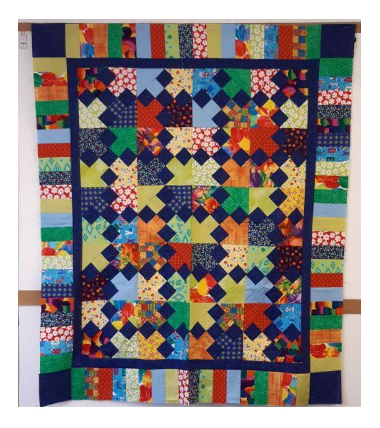
Approx. finished size: 46" by 54" By Valerie Nesbitt

This is a very simple and easy to make scrap quilt which can use up your scraps or a nickel pack. If you use a nickel pack then you need to use a very accurate and mean \frac{1}{2} " seam allowance. For each block you need to make a central 9 patch which has 4 squares of the background chain fabric matched with a small square of the fabric used in the corner triangle.